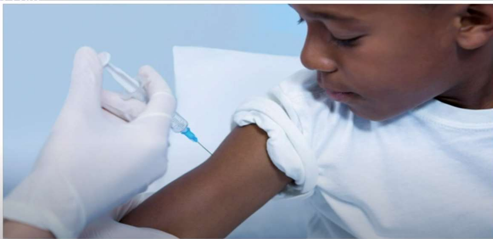
COVID-19 IN WESTERN NEW YORK