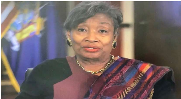
Senate Majority Leader Andrea Stewart Cousins

During the State Budget adopted in early April 1, there was a provision enacted that extended for another year – until June 30, 2022 – the existing law that permits nurse practitioners with more than 3,600 hours of experience to practice without a written collaborative agreement provided they maintain evidence of “collaborative relationships” with a physician in the same specialty practiced by the NP.