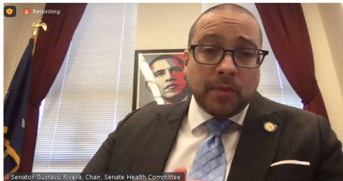
Senator Gustavo Rivera Chair of the Committee on Health